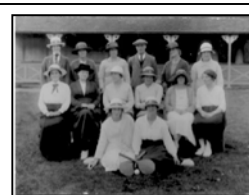
Ladies stoolball team 1920

The wickets are wooden boards on stakes and the ball, aimed at the wicket, does not pitch. The bat is the shape of a table tennis bat, made of willow with a long, sprung and spliced handle. Teams consist of 11 players either Ladies or Mixed.